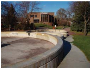
The city council will review plans for renewing the plaza.

On August 20, residents reviewed concepts for renewal of the plaza area. The concepts included a water feature, arbor, performance area and