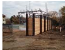
Installation of the new fence began Nov. 3.

Odessa II, the selected contractor, started the substation fencing on Monday, November 3. The fence is cedar and will be between eight and ten feet high.