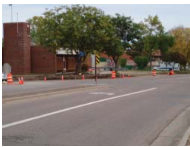
Streetscaping improvements continue along Excelsior Boulevard.

Construction on the Excelsior Boulevard streetscaping improvements, including installing new sidewalk, lighting and landscaping, began in mid-September. The concrete work is now substantially complete. The week of November 3, installation of brick pavers along the sidewalks and in the medians began. Due to the favorable weather conditions this fall, the landscaping originally scheduled for planting next spring is also being