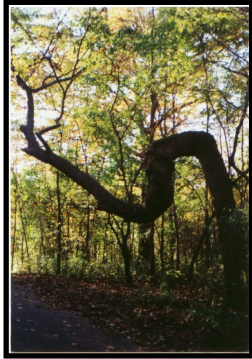
Landmarks can also be objects

The Landmark Recognition Program was established to recognize and honor significant buildings and places within the City of Minnetonka.