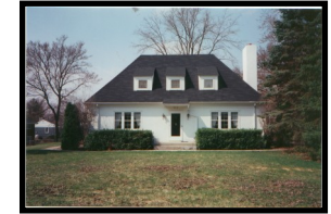
French eclectic cottage style

The Minnetonka History Commission is the lead agency in administering the landmark